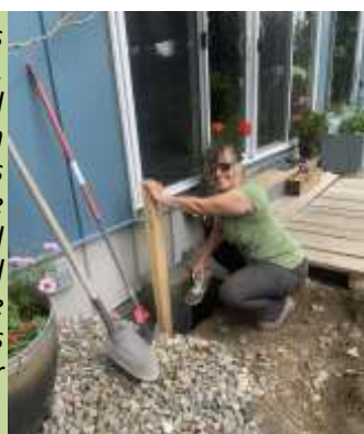
Live edge trim

Each year brings a new project or two to our table. As soon as the lake was clear we refurbished and repaired the main boardwalk across the marsh. Many of the original logs supporting the walkway were rotting but instead of replacing them (most were to big to move) we placed a 3x4 beam on them and secured them with GRK screws. Next we removed all the planks and flipped them over and reattached. Presto! Big job of 2023 was the pergola and deck. Using logs from our property, we milled, planed, stained and "got her done!" For 2024, we will build a deck around the pergola and firepit. January through March, the Ranch house kept us busy installing live edge trim around our pine ceiling. One more room and the ceiling trim is done. Final job in the coming winter will be the trim around the interior decorative glass! Always busy @ the Ranch!