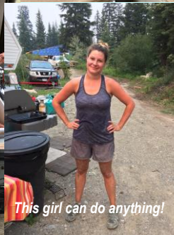
This girl can do anything!