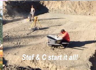
Stef & C start it all!