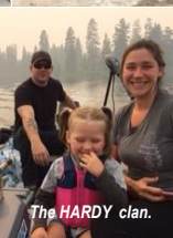
The HARDY clan.