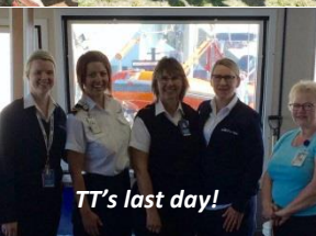
TT's last day!