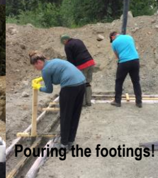
Pouring the footings!