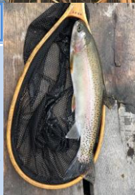
Diego lands one!

largest fish caught in 2018. CONGRATULATIONS! Noah , you are a double winner!