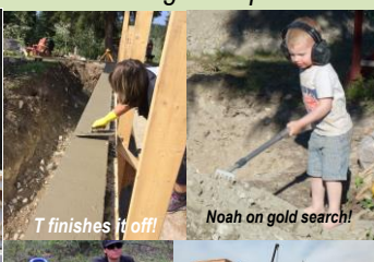
T finishes it off!