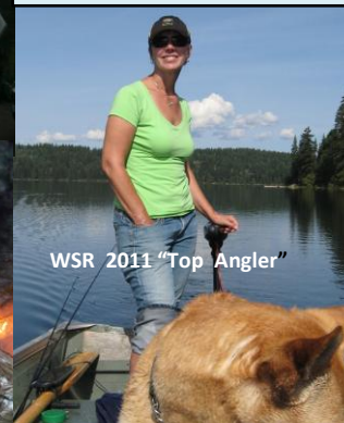
WSR 2011 "Top Angler"