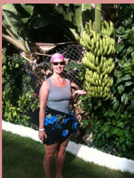
Dominican Feb. 2011