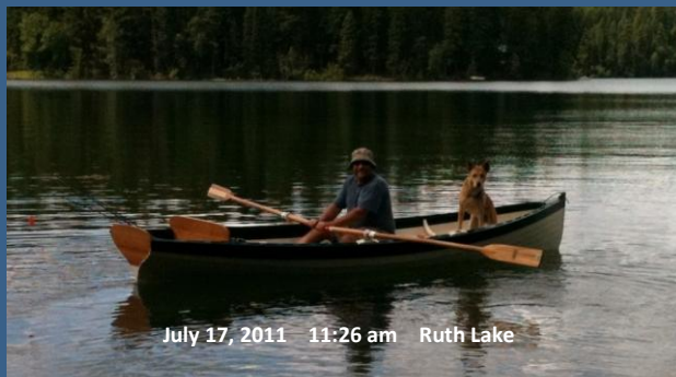
July 17, 2011 11:26 am Ruth Lake

at the Ranch in mid July. "Spitfire" is super fast rowing and I look forward to building a mast for her this winter and sailing her next summer.