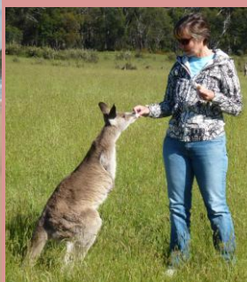
Couple of Wild Ones