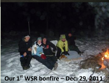
Our 1 st WSR bonfire - Dec. 29, 2011