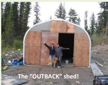
The "OUTBACK" shed!

busy year at the Ranch, the lake was the highest level in 30 years which meant road and trail maintenance. We finished stage two of our shed, putting up the back and building the front and we bought a 30 ft. trailer to