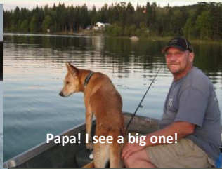
Papa! I see a big one!

Memories don't just happen, they have to be made! Make the effort!