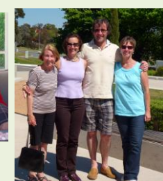
Our Aussie Family!

I continue to cut fairways and fescue at Morgan Creek GC , love working outdoors and still do some marketing work for my baseball buddies at Big League Experience. "Get it Done" will be my mantra for 2012; I will continue to believe in "No Bad Days" and I will do my best to get the most of every moment I am given with my loved ones! Make 2012 a special one for all around you! God Bless!