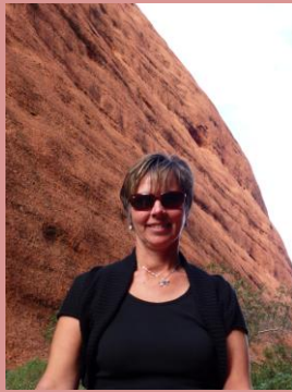
Kata Tjuta, Northern Territories