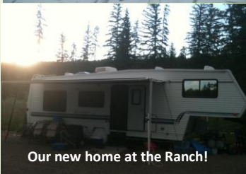
Our new home at the Ranch!

Memories don't just happen, they have to be made! Make the effort!